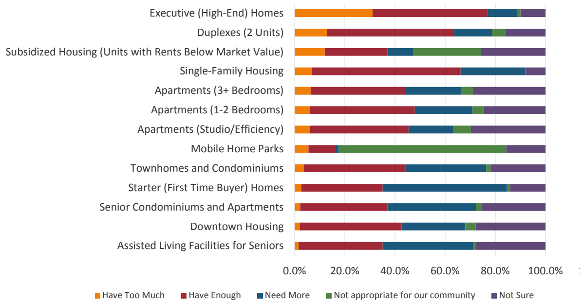
Figure 2.2 Question 16 from Community Survey