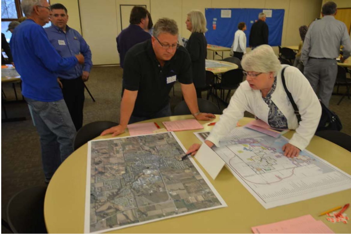
Figure 2.3 Map Activity from Public Meeting #1 on April 19, 2016